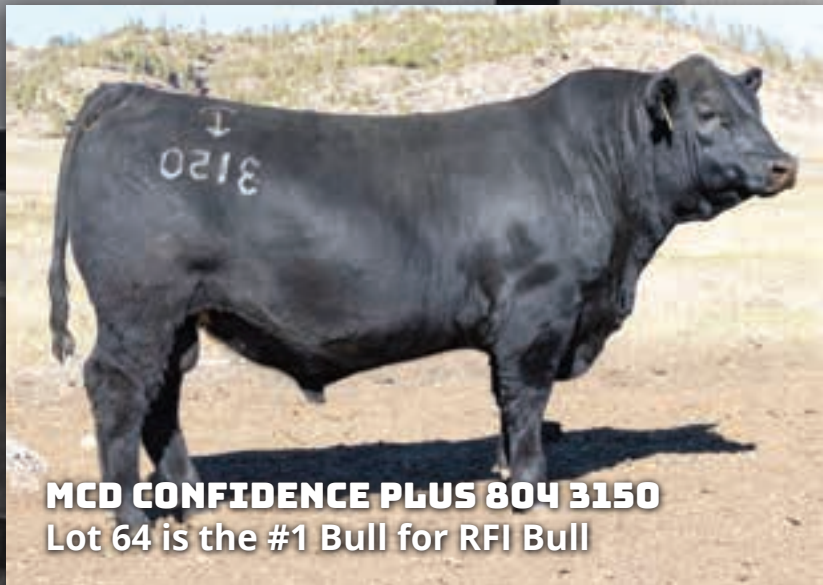
MCD CONFIDENCE PLUS 804 3150 Lot 64 is the #1 Bull for RFI Bull