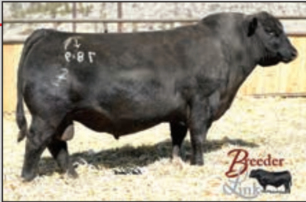
Semen Sales leased to Breeder Link Phone number 208-681-9711