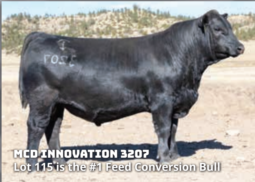
MCD INNOVATION 3207 Lot 115 is the #1 Feed Conversion Bull